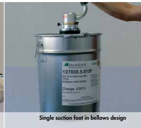
Single suction foot in bellows design