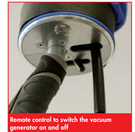
Remote control to switch the vacuum generator on and off