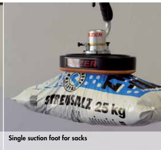
Single suction foot for sacks