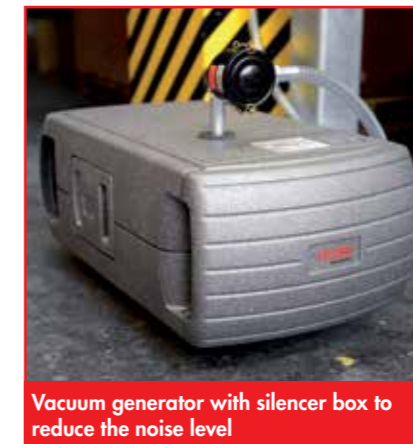
Vacuum generator with silencer box to reduce the noise level