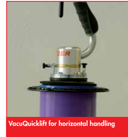
VacuQuicklift for horizontal handling