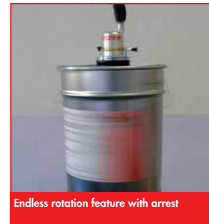
Endless rotation feature with arrest