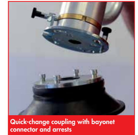
Quick-change coupling with bayonet connector and arrests